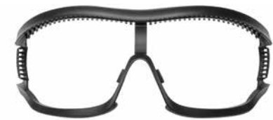
face-fit foam pad available

SHS 15-2 microfiber bag black SHS 30 microfiber bag beige SHE 151 hardcase FK 81-3 box