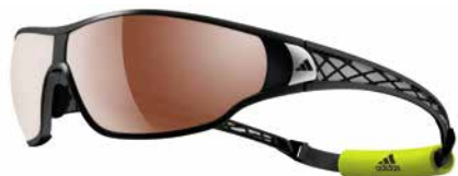
a189/a190 00 6050 matt black/grey