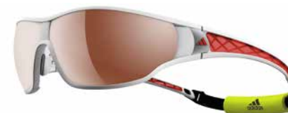
a189/a190 00 6052 shiny white/red