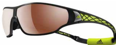
a189/a190 00 6051 matt black/labtime