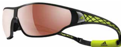
a189/a190 00 6054 matt black/labtime