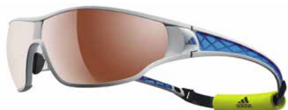
a189/a190 00 6053 silvermet/blue