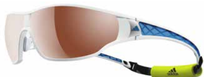
a189/a190 00 6056 white/blue