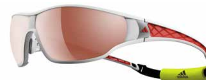
a189/a190 00 6055 shiny white/red